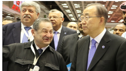
Former UN Secretary-General Ban Ki-moon (right) visiting the Exhibition Hall