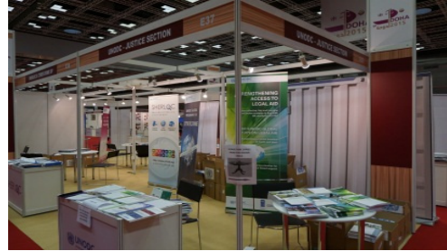
Qatar's exhibition booth