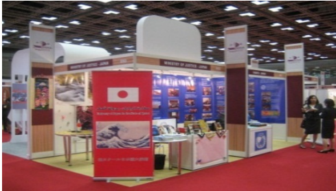
Japan's exhibition booth