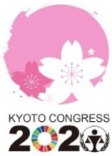
Exhibit at the Kyoto Congress

a United Nations conference that aims to achieve safe and secure society