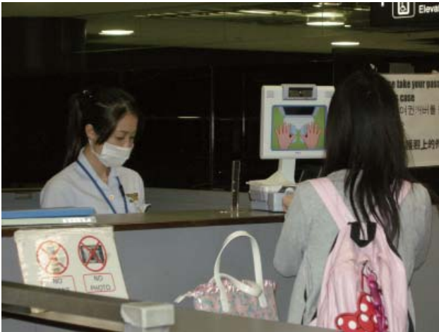
Immigration Examination through the Use of Personal Identification Information

enter the country illegally with fake fingerprints by damaging them directly or going through a surgical procedure, or with altered passports, in order to avoid detection of their displacement in the past. If such fake fingerprint cases occur, the Immigration Bureau should not only adopt procedures for displacement, but also cause them to be subject to strict punishment, including criminal punishment. Therefore, the bureau makes a report and accusation of illegal entry to investigative authorities, and is striving to detect fake fingerprints by upgrading devices