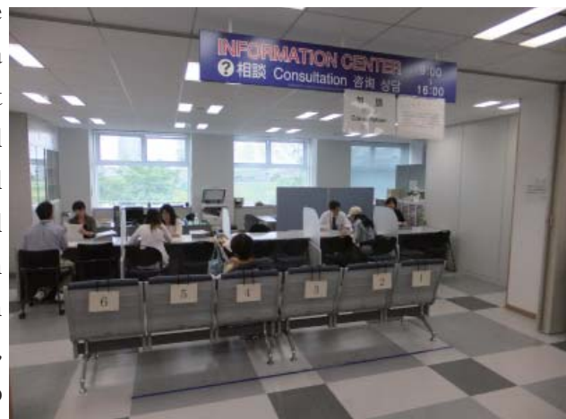
The Immigration Information Center (Osaka Regional Immigration Bureau)

These information centers were established in the Tokyo Regional Immigration Bureau and its Yokohama District Immigration Office, the Nagoya Regional Immigration Bureau, the Osaka Regional Immigration Bureau and its Kobe District Immigration Office, the Hiroshima Regional Immigration Bureau, the Fukuoka Regional Immigration Bureau, and the Sendai Regional Immigration Bureau. They provide consultations on procedures for the entry and residence of foreign nationals in various languages, such as English, Korean, Chinese and Spanish. At the Sapporo Regional Immigration Bureau, the Takamatsu Regional Immigration Bureau, and the Naha