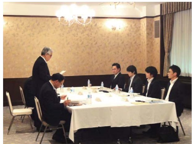
Request for employers' associations to take countermeasures against illegal foreign workers by the National Police Agency, the Ministry of Justice, and the Ministry of Health, Labor, and Welfare