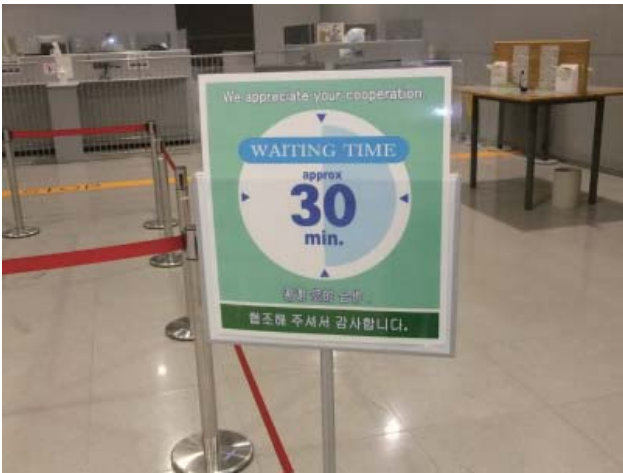
Indication of waiting time for examination