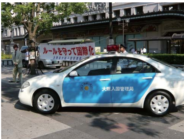
Scene from the Illegal Work Prevention Campaign