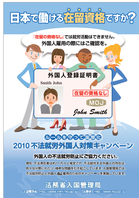
Front page of the leaflet for the Illegal Work Prevention Campaign

Main public relations activities include conducting press releases of statistics concerning immigration control administration such as the numbers of those entering or leaving Japan and of overstayers and posting and disseminating such information through websites of the Ministry of Justice. In addition, the Immigration Bureau publishes information including cases of special