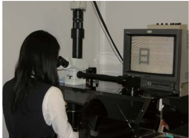
Countermeasures against forging or alteration of documents