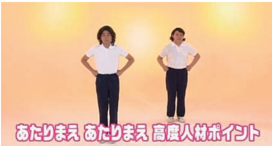
Publicity video made through a tie-up plan with Yoshimoto Creative Agency Co., Ltd. (Automated gates and Points-based system for highly-skilled Professionals)