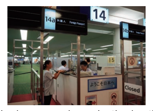
Newly-arranged examination booth

Measures are being implemented to reduce the waiting time for landing examinations such as simplifying a disembarkation card for foreign nationals (omission of some of previously required details), which is submitted by the foreign nationals to an immigration inspector at the time of landing examination (enforced from April 1, 2016), and increasing the number of booths through the installment of a newly-arranged examination booth in which two immigration inspectors are located front and back to conduct a landing examination respectively at the same time.