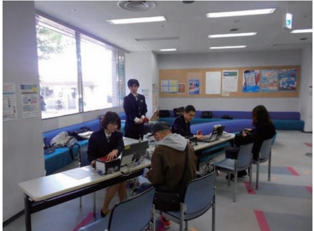
On-site registration using a mobile device to register as a user of the automated gates