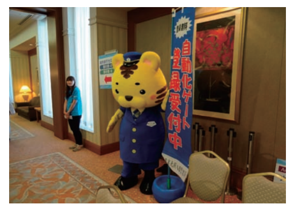
Promotion of the automated gates

In 2017, as a tie-up plan with Yoshimoto Creative Agency Co., Ltd., the Immigration Bureau produced publicity videos on the automated gates and points-based system for highly-skilled professionals and posted them on the Ministry of Justice website. In addition, for the purpose of preventing illegal work through the appropriate employment of foreign nationals, the Immigration Bureau holds an "Illegal Work Prevention Campaign" as part of the larger campaign for "Foreign Labor Problems Awareness Month" conducted by the government every June, so that the general public, companies hiring foreign nationals and relevant organizations and governments in other countries will be able to better understand the issues and offer cooperation to the Immigration Bureau.