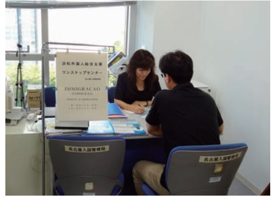
Immigration Information Center