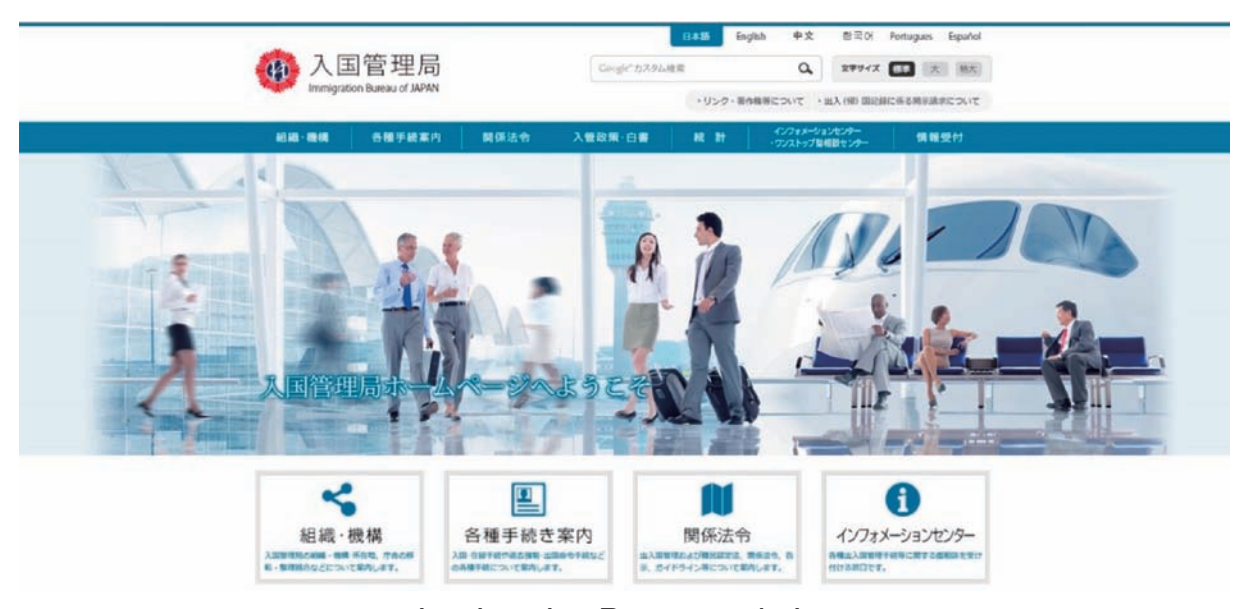
Immigration Bureau website

In addition, in order to improve the provision of information to foreign nationals, we have been providing translations in English, Chinese, Korean, Portuguese and Spanish since FY 2005 and have also been striving to enhance convenience for foreign nationals by continuously improving the contents.