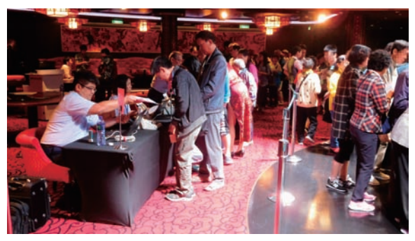
Cruise ship examinations

In addition, the operation of a system of landing permission for cruise ship tourists permitting foreign passengers of cruise ships designated by the Minister of Justice to land through simplified procedures commenced on January 1, 2015, with permission granted to 1,070,000 passengers in 2015 and 1,940,000 passengers in 2016.