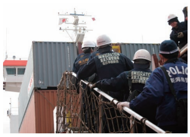
Detection on a smuggling boat