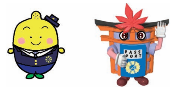
"Immiglemon-chan" and "Gate-kun"

The designs have just been completed, so their appearances are limited to Twitter and have been printed on the envelopes and other materials of Hiroshima Regional Immigration Bureau, but in the near future, the characters of "Immiglemon-chan" and "Gate-kun" will dress up in costumes, and we hope that they will develop a notable presence at events taking photos with the children.