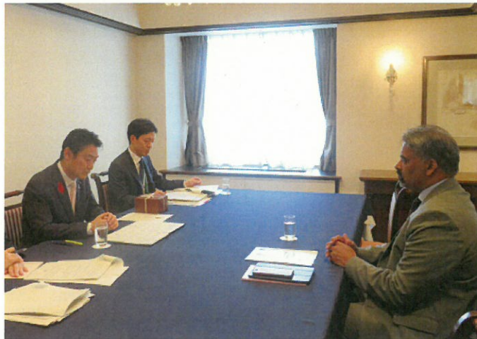
Minister Gobin (Mauritius, right) and Minister Yamashita (left),