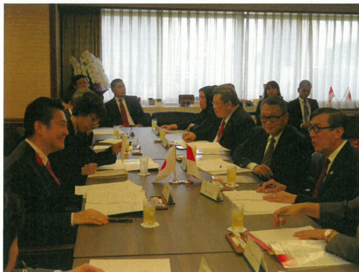
Minister Yasonna (Indonesia, right) and Minister Yamashita (left), having discussions

The bilateral meetings with the ministers contributed to the establishment of the platform of “Justice Affairs Diplomacy”, which is a series of domestic and international policies of justice affairs that the MOJ is working on holistically and strategically with a view to permeating the rule of law throughout the world.