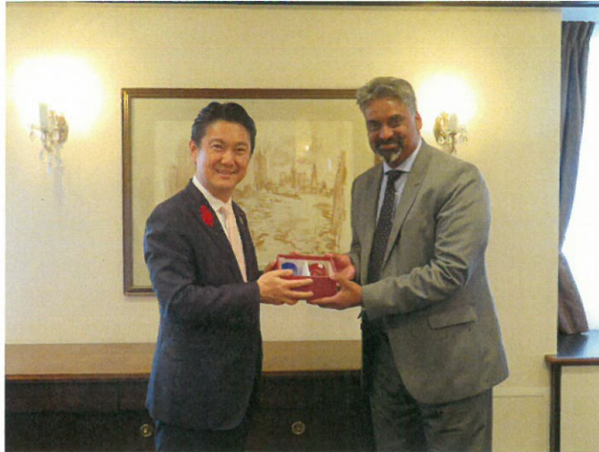
Minister Gobin (Mauritius, right) and Minister Yamashita (left)