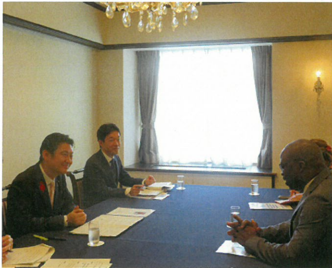
Minister Masutha (South Africa, right) and Minister Yamashita (left), having discussions