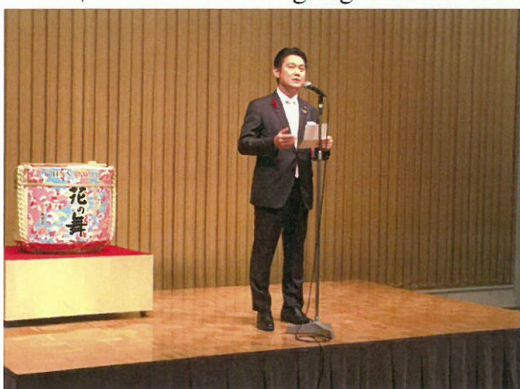
Minister Yamashita giving his remarks at the reception

In his welcome remarks, Minister Yamashita underscored Japan’s active engagement in, and continued support for, the Asian and African regions. He also expressed his appreciation for AALCO’s valuable and ongoing contributions to the field of international law.