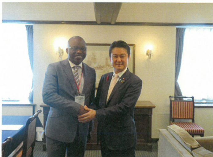
Minister Masutha (South Africa, left) and Minister Yamashita (right), shaking hands