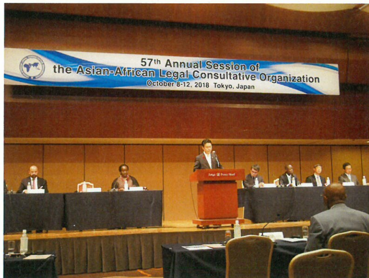
Minister Yamashita delivering the opening remarks at the inaugural session

The inaugural session of the 57th Annual Session of AALCO was held at the Tokyo Prince Hotel on Tuesday, October 9, 2018. Minister of Justice, Takashi YAMASHITA delivered the opening remarks. Participants from 33 member countries and region were in attendance.