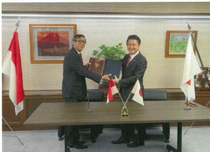
Minister Yasonna (Indonesia, left) and Minister Yamashita (right), exchanging the signed documents of MOC

During the bilateral meeting with Mr. Yasonna, Minister of Law and Human Rights of Indonesia, Minister Yamashita hosted a signing ceremony for the Indonesia-Japan Memorandum of Cooperation (MOC), establishing a comprehensive framework for cooperation in the field of legal affairs administration between the Ministry of Law and Human Rights of Indonesia and the MOJ.