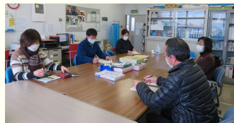
Offender Rehabilitation Support Center